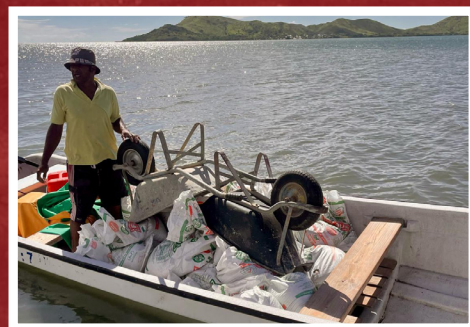
FIJI UPDATE Page 4