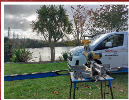
PROJECT REPORTS Page 6