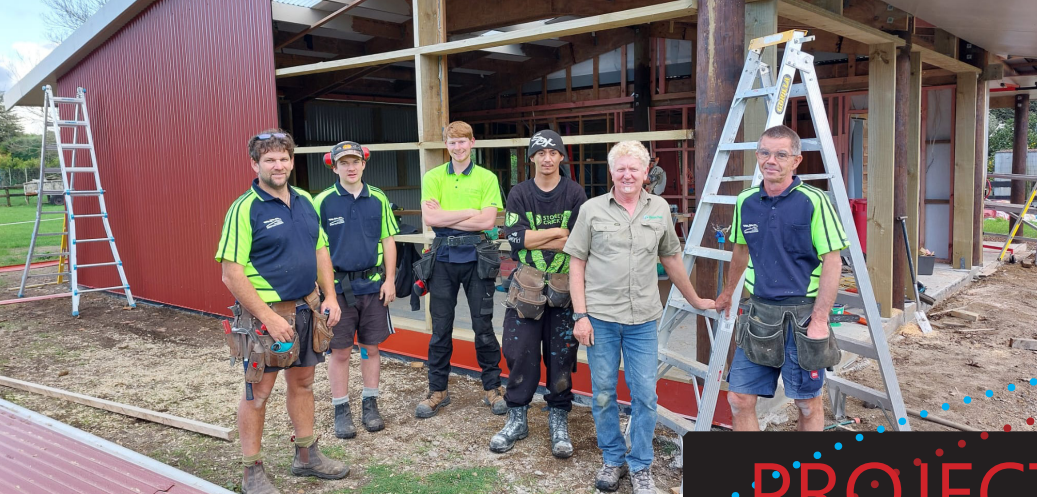
Photo on left -The MMM team spent three weeks at Finlay Park knocking off a number of jobs.